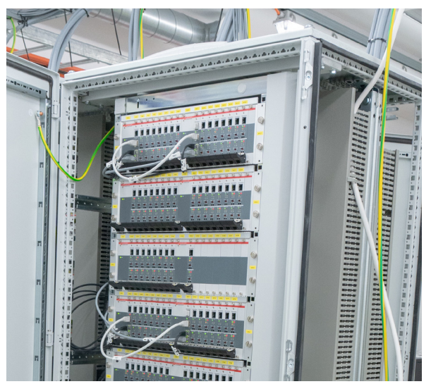
Frauscher Diagnostic System FDS